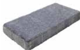
Format 40 x 20 cm

Format 40 x 20 cm = ca. 12,5 Stück je m 2